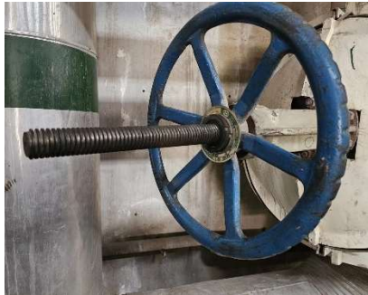
Fig. 2 Inlet of the feed water pump

increase of the operation years of the pump set, its own efficiency decreases, and there is also throttling loss in the constant and variable speed pump system. To further reduce the unit consumption of the feedwater pump, it is necessary to decrease the throttling loss of the feedwater system.