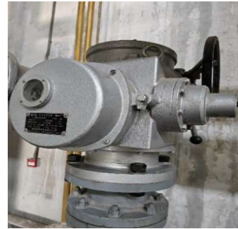
Fig. 3 Outlet of the feed water pump

Although throttling regulation is a common flow control method, it will cause certain energy loss. Specifically, the throttling regulation losses mainly include the following aspects: