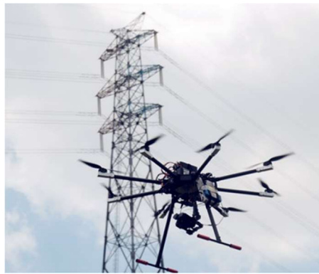
Fig. 1 UAV-Based Survey

In the preliminary design phase of transmission lines, UAVs can replace traditional surveying equipment to perform tasks such as topographic surveying and corridor environment analysis. By combining aerial imagery with GPS positioning and inertial navigation systems, UAVs generate high-precision digital elevation models (DEMs) and orthophotos, providing accurate foundational data for route planning and construction design. Additionally, UAVs equipped with LiDAR systems can rapidly acquire ground point clouds in complex terrains such as forests and mountainous areas, enabling precise modeling of the ground surface and vegetation conditions.